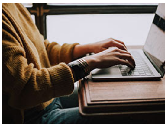
Take the new 30-minute online module: So you're a union rep...now