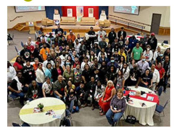
The Black, Indigenous & Workers of Colour Conference is a bilingual event for members who self-identify to gain skills and build